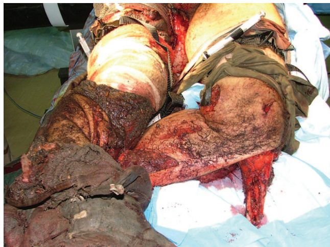
Fig. 3. Patient with bilateral mangled lower extremities/traumatic amputations, hemorrhage controlled with Special Operation Forces Tactical Tourniquet (SOFTT).