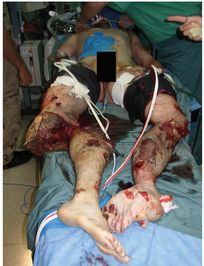
Fig. 2. Patient with traumatic amputation on right and mangled leg on left, controlled with pneumatic tourniquets.

This difference is likely related to the physical findings that would prompt a medic to place a tourniquet. Patients who required primary or debridement amputations frequently had dramatic appearing traumatic amputations (Fig. 2), mangled extremities (Fig. 3), or severe soft tissue components to their wounds (Fig. 4). Patients with reconstructable vascular injuries were more likely to have less soft tissue and bony destruction and contained hematoma without active bleeding (Fig. 5). Hence, medics were less likely to place a tourniquet on these injuries.