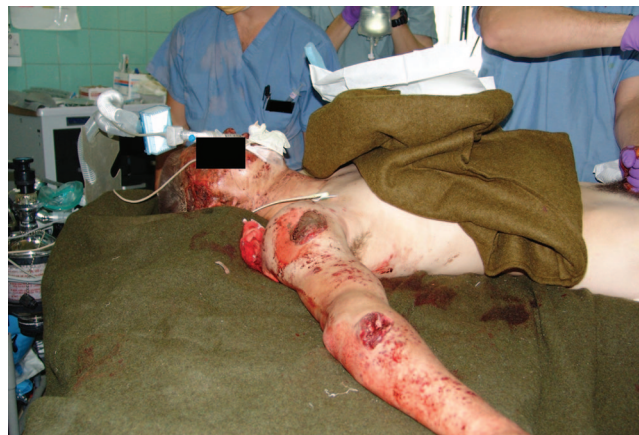
Fig. 5. Patient with multiple fragment wounds to right upper extremity. Brachial artery and vein were transected but contained in a hematoma.

on survival, incidence of neurologic injury, and ischemia-related complications.